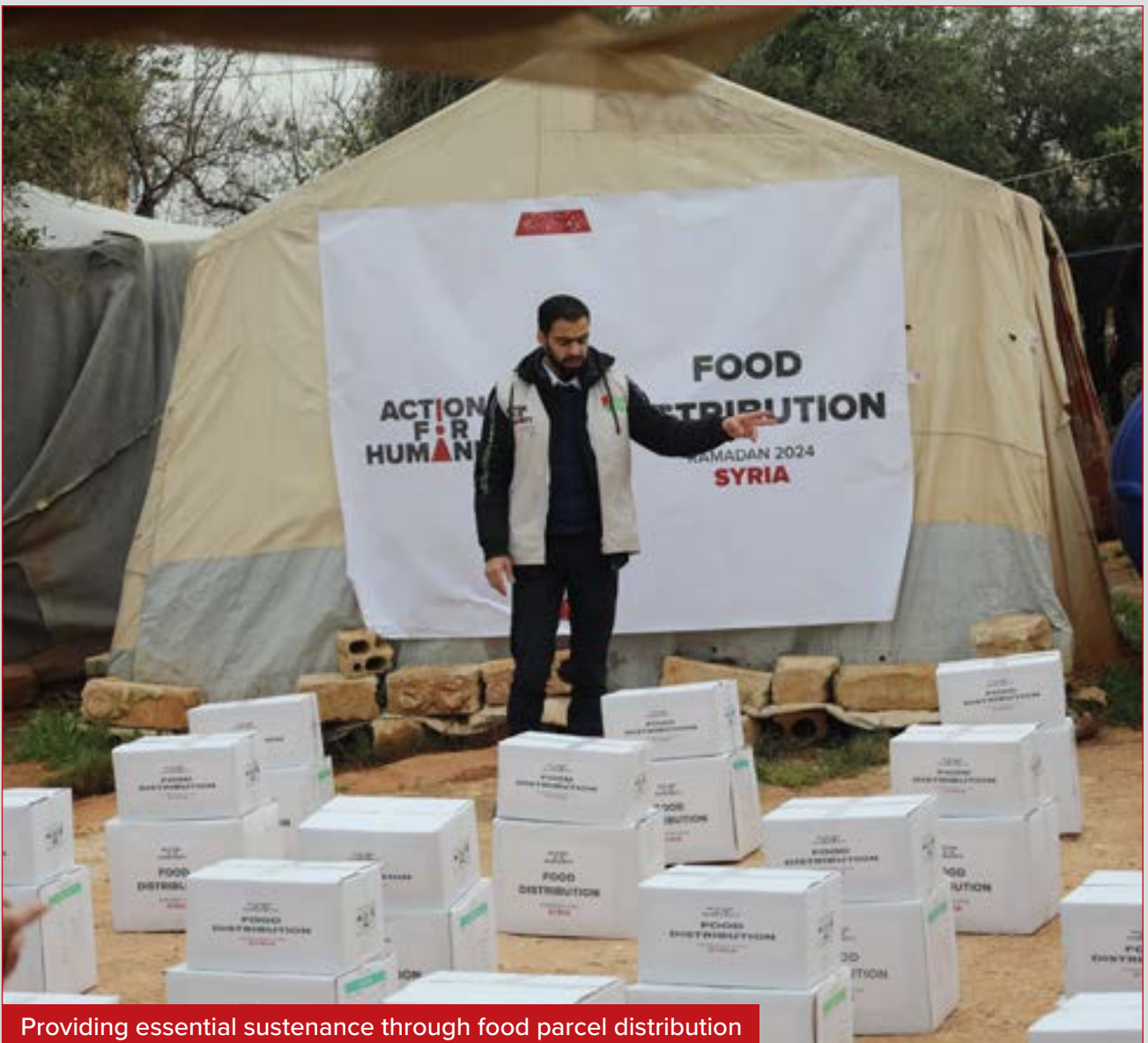
Providing essential sustenance through food parcel distribution