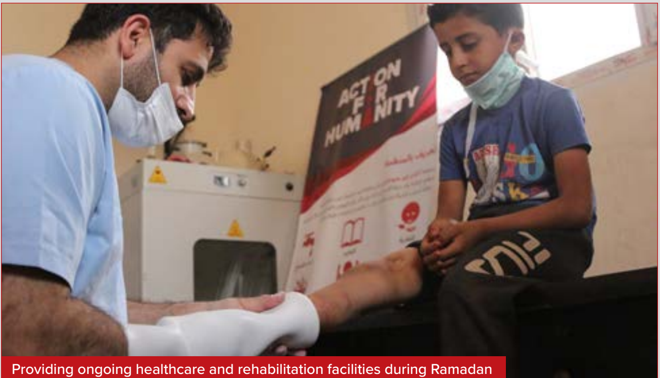
Providing ongoing healthcare and rehabilitation facilities during Ramadan

Prosthetic Limbs for Children: Supported by a grant, this initiative provided 10 children with prosthetic limbs, enhancing their mobility and independence.