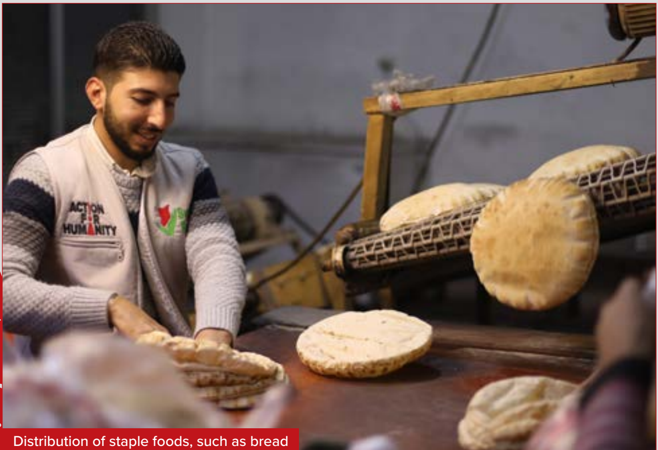
Distribution of staple foods, such as bread

Special Grant Support: With a total grant allocation of £37,500.00 , we distributed additional food rations to displaced communities, ensuring access to nutritious meals for those in need.