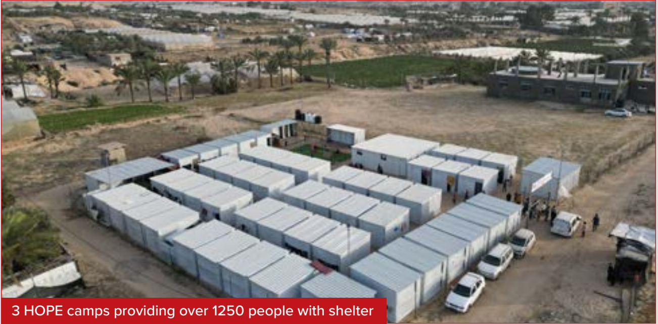
3 HOPE camps providing over 1250 people with shelter

After nearly 9 months of devastating conflict, over 35,000 Palestinians have lost their lives, more than 81,000 are wounded and more than 10,000 are still thought to be buried under rubble. During the month of Ramadan, we worked tirelessly to provide necessary support to the affected community.