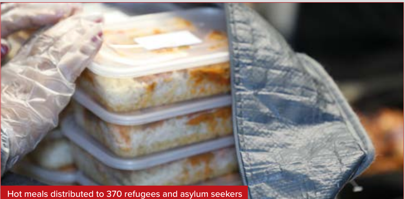
Hot meals distributed to 370 refugees and asylum seekers

Hot meals: Closer to home, we tackled food insecurity by distributing hot meals to 370 refugees and asylum seekers. This effort, guided by community support, provided not only nourishment but also comfort and a sense of community during the holy month