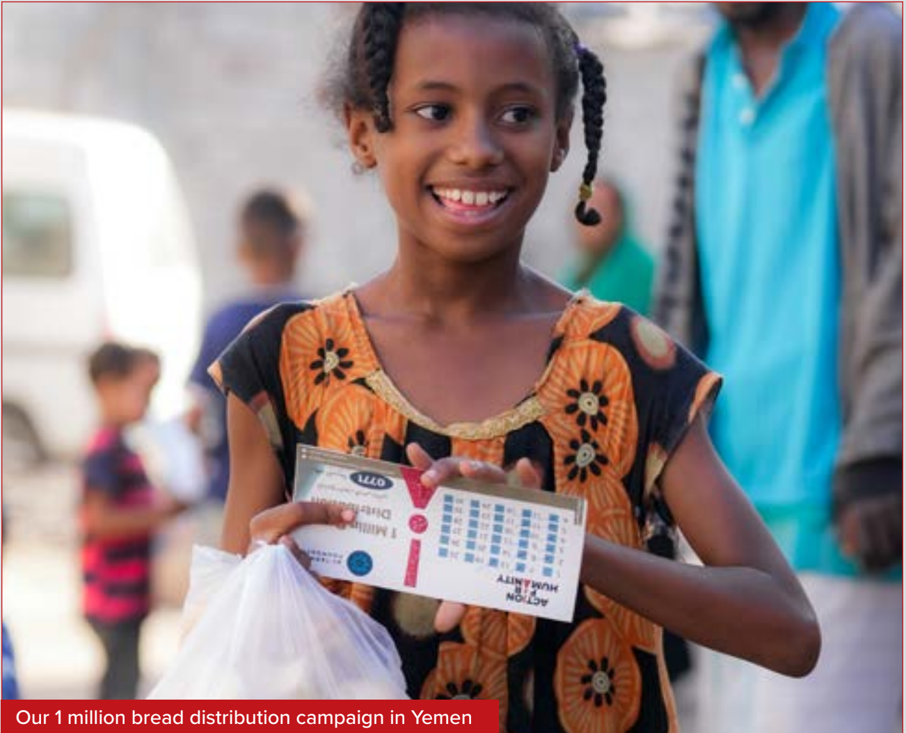
Our 1 million bread distribution campaign in Yemen

Food parcels: Over 650 households in Yemen, around 4,550 individuals, received food parcels worth £48,271.00.