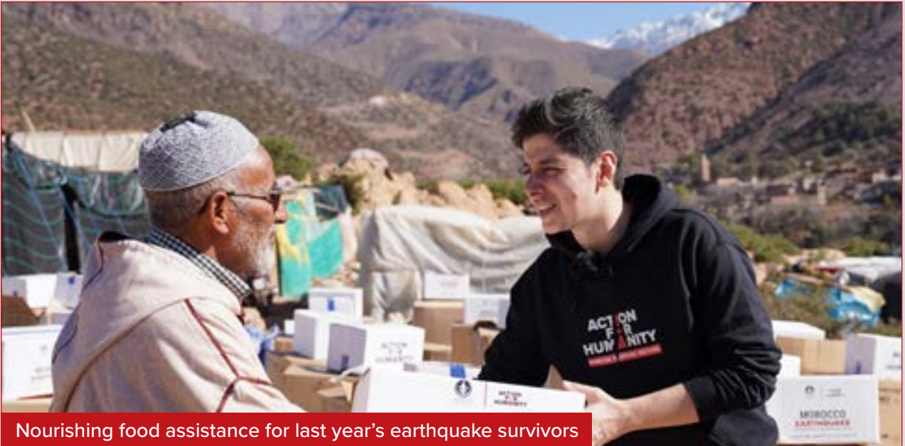
Nourishing food assistance for last year's earthquake survivors

Food distribution: We distributed Iftar meals and food baskets to 1,051 households (4,204 individuals), addressing both immediate hunger and long-term food security.