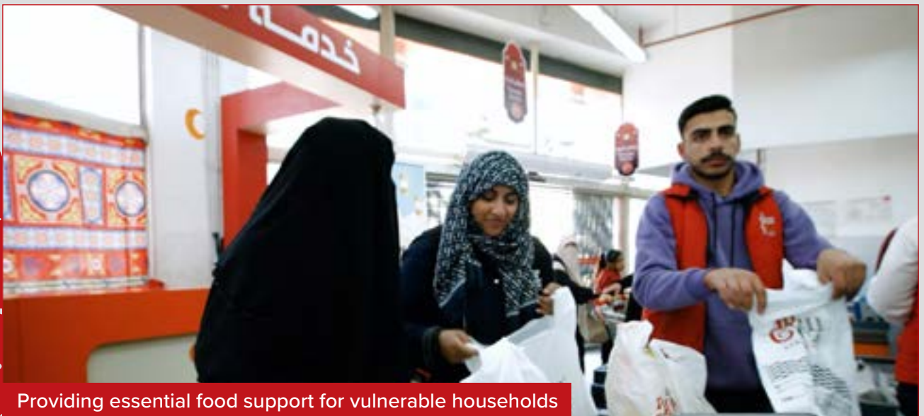
Providing essential food support for vulnerable households