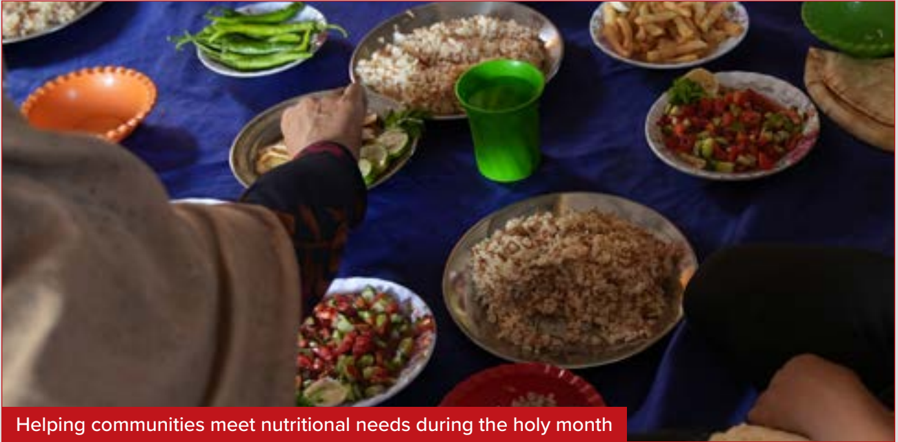
Helping communities meet nutritional needs during the holy month

Ramadan Iftar for University Students: We sponsored and organised a special iftar at a local university, catering to the dietary needs of 166 students . This initiative not only provided essential nourishment but also fostered a sense of community and support among students during the holy month.